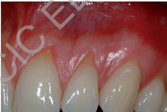
Figure 2 Vision of the recessions by a greater magnification.