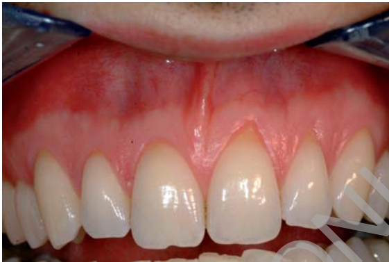
Figure 1 Multiple recessions on the elements 2.1, 2.2 respectively of mm 2, 3, ordered as 1 class of Miller.

Finally, we provided the patient with the essential postoperative indications in order to obtain a good recovery: we prescribed to the patient a non-steroidal anti-inflammatory, Brufen 600mg 1 every 8 hours and in case of need, we advise an appropriate home hygiene for his mouth (excluding the area surgically treated) and an antiseptic with 0,12% of clorexidina for 15 days, 2 times per day (Figs. 10-13).