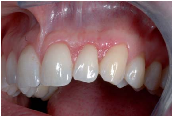
Figure 11 Control after 2 weeks.