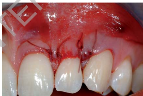
Figure 9 Suture with Vicryl 5/0.

We advised a soft post-surgical toothbrush only from the third week and then a middle bristle toothbrush from the fourth week.