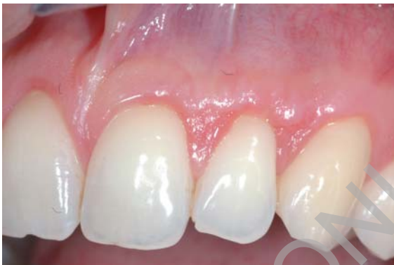
Figure 12 Control after 3 weeks.