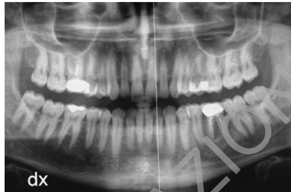
Figure 3 Panoramic Rx; it's possible to see the good level of the interproximal bone around 2.1, 2.2 and 2.3.