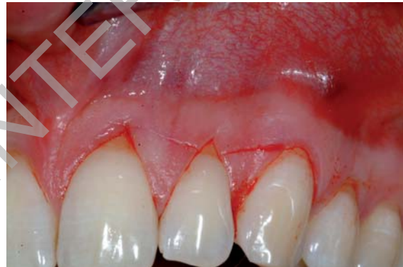
Figure 4 A partial-thickness dissection was raised starting from the line of enamel-cement of the adjacent teeth (2.1, 2.3) and convergent to the lateral incisor, drawing the new surgical papilla.