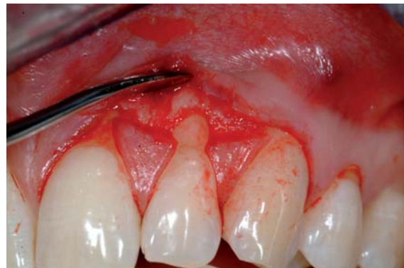
Figure 5 A full-thickness flap until the mucogingival junction without carrying out released cuts.