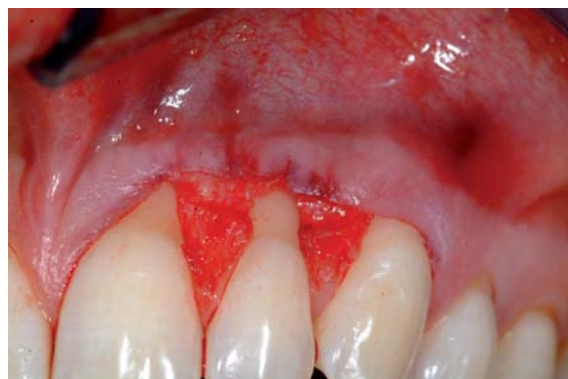
Figure 6 Interproximal papillas disepitelized.