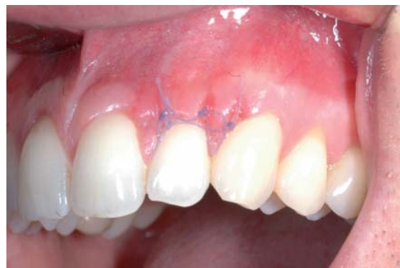
Figure 10 Healing at the suture removal.

The patients' growing attention for the appearance and the harmony of him smile, considered as the