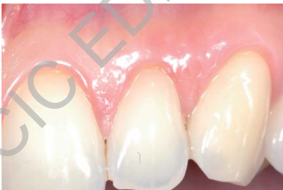
Figure 13 Control after 3 months; by a greater magnification it's possible to observe the perfect healing of the periodontal tissues.

complex of teeth and gums, put the dentist in front of new problems.