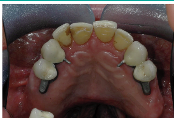
Figure 3 The intraoral test of the PFM splinted crowns with the attachments performed by EDM technique.

Figure 7 shows a detail of the PFM crowns and removable dental prosthesis with the own attachments performed by EDM technique: the latch of the removable prosthesis attachment will find location in the slot of the attachment of the PMF crowns, to retain and give stability to the removable dental prosthesis with obturator.