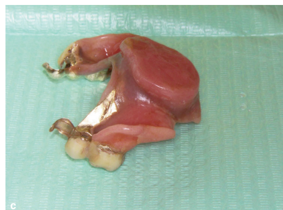
Figure 2 a, b, c Frontal view (a), occlusal view (b) of the removable dental prosthesis with conventional attachments and gold crowns/resin. The removable dental prosthesis (c).