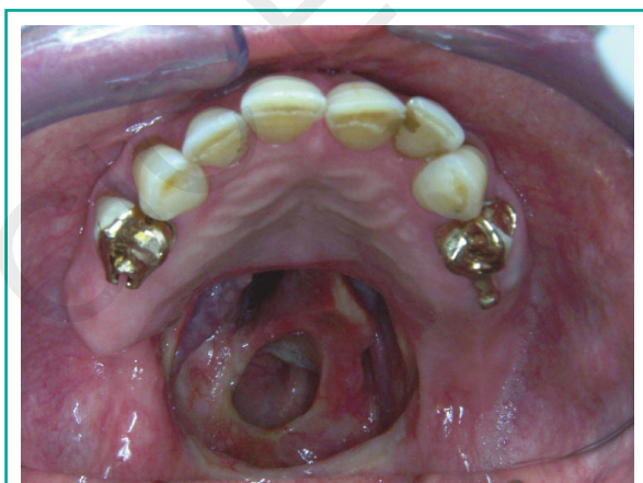
Figure 1 A great palate defect with oral nasal communication.

The new rehabilitation treatment of this oral-nasal communication was a mixed prosthetic rehabilitation (fixed and removable), a removable