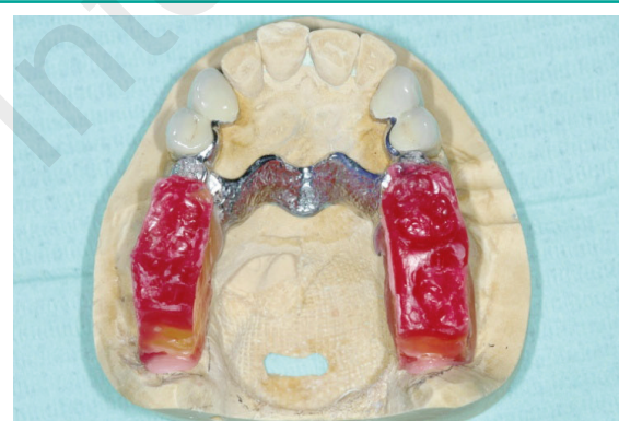
Figure 5 The model with the occlusal vertical dimension (VDO) in wax.