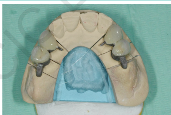
Figure 4 The master model and the PFM splinted crowns with the attachments performed by EDM technique.