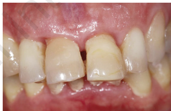
Figure 1 Intraoral patient's photo.

crowns for the replacement of teeth 11-12-21-22, a zirconia solid zirconia ez crown for the rehabilitation of 13, and a lithium disilicate veneer for the rehabilitation of 23. The patient is a 55-year-old woman asking for aesthetic improvement of the smile and the closure of the diastema between the maxillary central incisors. At first, a photo of the patient's smile was taken (Fig. 1). Using the digital smile technology it was possible, from that photo, to obtain a virtual wax-up of the final restoration by making a cutout of the original teeth (Fig. 2). The virtual wax-up offers important advantages to the clinician and to the laboratory and allows an efficient planning of the work. First, it is immediately available and it can be directly used to build up the final dental prosthesis allowing a saving of cost eliminating the manual reproduction of the