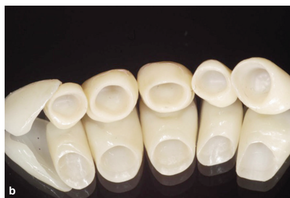
Figure 6 a, b CAM prosthesis.