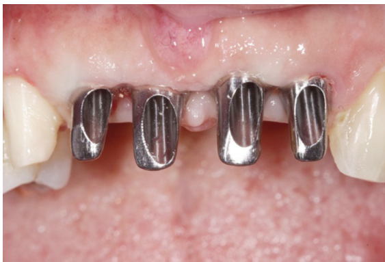
Figure 7 Definitive rehabilitation: the abutments.