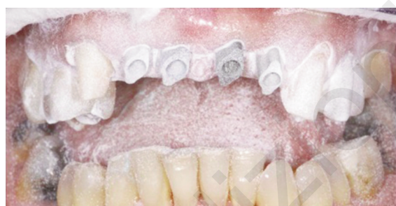
Figure 3 Digital impression using intraoral implant scan bodies.

project by the laboratory. Second, it offers the possibility to the patient to have a personal and extremely realistic view of what would be the resulting smile after rehabilitation. Once the diagnostic project has been accepted by the patient, the insertion of 4 implants in seat 11-12-21-22 and the prosthetic preparation of the 23 and 13 were performed. After four months, a direct digital impression was taken using an intraoral scanner to register the two arches and the right occlusion. To take the impression was used the 3mlavacos intraoral digital scanner and intraoral implant scan bodies, to take the oral scan was also used a powder scan spray to make better the image resolution (Fig. 3). Important to note, it took only 2 minutes without any problems relating to gag's reflex and it prevents organoleptic's bothers in the patient. The virtual model (Fig. 4) was sent through a digital way to the laboratory, which proceeded with the CAD-CAM production. The virtual modeling was per-