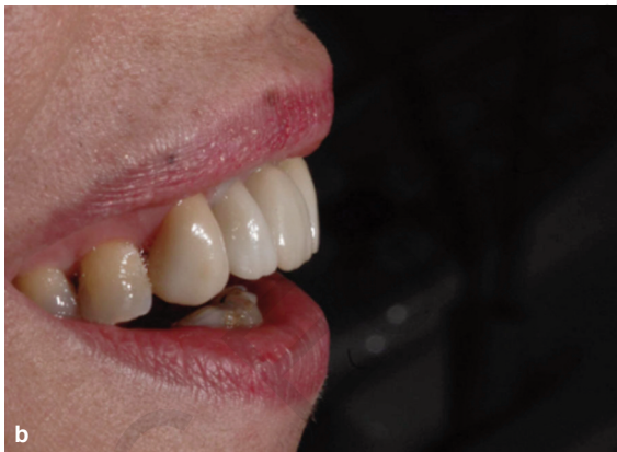
Figure 8 a, b Front and lateral view of the final aesthetic.

tion of the prosthetic rehabilitation (Figs. 7, 8 a, b). We delivered the finished prosthetic with no need of retouching as assess with the aid of maps of articulation. The modeling software used for the treatment of this clinical case have allowed to obtain a prosthesis extremely precise in the occlusal relationships with the opposing arch, the marginal fitting and in the reproduction of aesthetics simulated with virtual diagnostic wax-up.