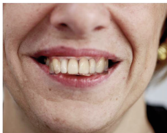
Figure 2 Virtual diagnostic wax-up.