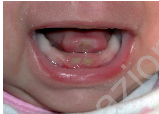
Figure 1 Riga-Fede disease and neonatal teeth.

The parents refused permission to perform a tongue biopsy therefore hystopathological examination could not be carried out. Based on the history and clinical features, a diagnosis of RFD was made.