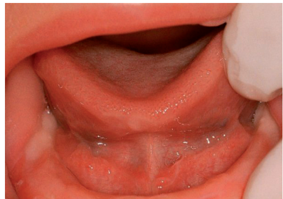
Figure 6 Follow-up at 1 year.

RFD is a reactive traumatic mucosal disease characterized by persistent ulcerations of the oral mucosa. It develops as a result of repetitive trauma of the tongue by the mandibular incisor teeth during continual protrusive and retrusive movements (1,5). The condition is most commonly observed in newborns and the beginning of the lesions usually coincides with the eruption of the primary teeth; however, the symptoms can be observed immediately after birth with natal and neonatal teeth (1).