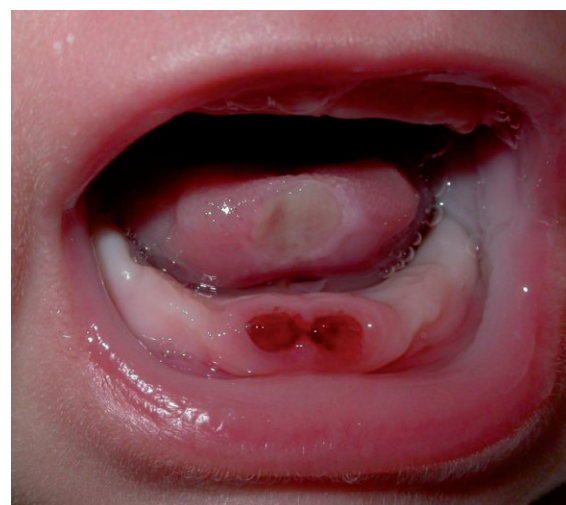
Figure 2 Riga-Fede disease and extraction sites of neonatal teeth.

With the parental consent the extraction was carried out under topical local anaesthesia (Fig. 2) and was