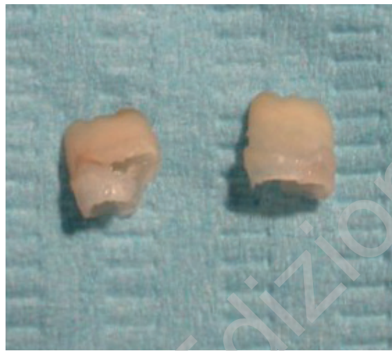
Figure 3 Neonatal extracted teeth.

The infant, revised at the 1-year follow-up visit, presented an healthy mucosa of the tongue (Fig. 6).